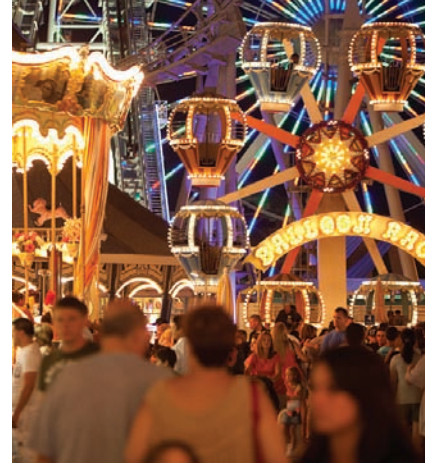
25th Avenue Amusement Pier, Wildwood

New Jersey Historic Preservation Office and New Jersey Department of Community Affairs. Grant and technical assistance requests to these agencies always exceed available resources.