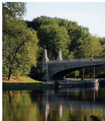
Essex County Branch Brook Park, Newark