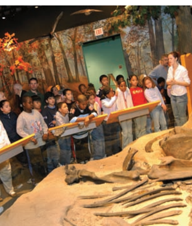
Newark Museum, Newark (Newark Museum)

merchandise), enhanced interpretation at parks and recreation areas, creation of inventories and evaluation of the impact of heritage tourism.