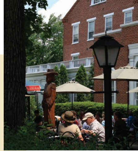
Lancaster County, PA

Pennsylvania launched a statewide heritage tourism initiative by working with four pilot regions (Philadelphia's African-American Heritage, Lower Bucks County, Lancaster County and the Oil Heritage Region) in the early 1990s. Assisted by the National Trust for Historic Preservation's Heritage Tourism Program, a statewide heritage tourism advisory committee oversaw the pilot regions' work. At the end of the four-year pilot, a summary of the accomplishments in each region was presented to state decision makers. Working intensively with four pilot regions was a cost-effective way to determine the return on a statewide investment in heritage tourism. Other states—such as Indiana, Wisconsin, Texas, Tennessee, Iowa, Illinois and Colorado—have also launched statewide heritage tourism programs by working with pilot regions.