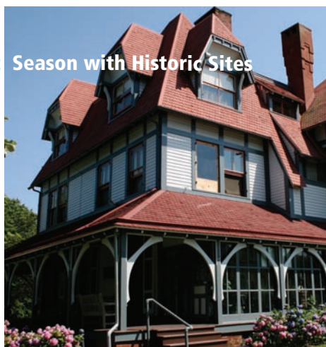
Emlen Physick Estate, Cape May

In Cape May , heritage tourism has successfully expanded the traditional 12-week beach resort tourist season. Almost 300,000 visitors a year tour the town's three restored historic sites (the 1879 Emlen Physick Estate, the 1859 Cape May Lighthouse and the World War II Lookout Tower), take an array of community history tours (on five trolley buses, by boat and walking through historic interiors) and participate in a year-round schedule of special events.