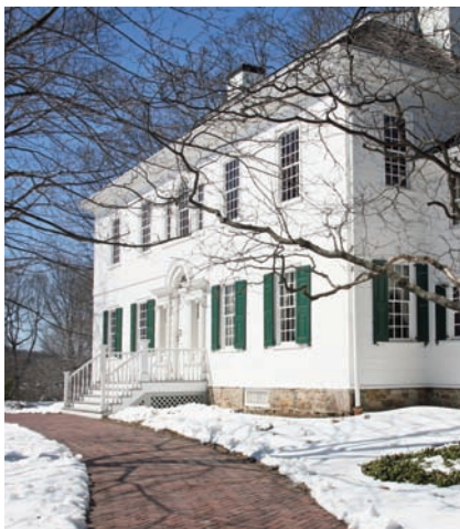
Ford Mansion, Morristown National Historical Park, Morristown

Morris County's Destination Marketing Organization uses limited financial resources strategically to promote the area's history. The plan showcases four National Historic Landmarks to show trends in the nation's development and to connect the sites to current issues. The DMO has reached visitors through national magazines like Preservation and American Heritage . Morristown was named one of the National Trust