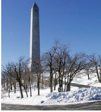
High Point Monument, High Point State Park

The Edison National Historical Park offers an opportunity for heritage travelers to see the factory where Thomas Edison worked for 44 years, developing more than half of his 1,093 patents for his inventions. Several factory floors with new exhibits were opened to the public for the first time in October 2009 after a 6-year, $13 million restoration effort. Between opening day October 9, 2009 and January 3, 2010, close to 16,000 visitors toured the laboratory complex; 6,000 also visited Edison's home, Glenmont.